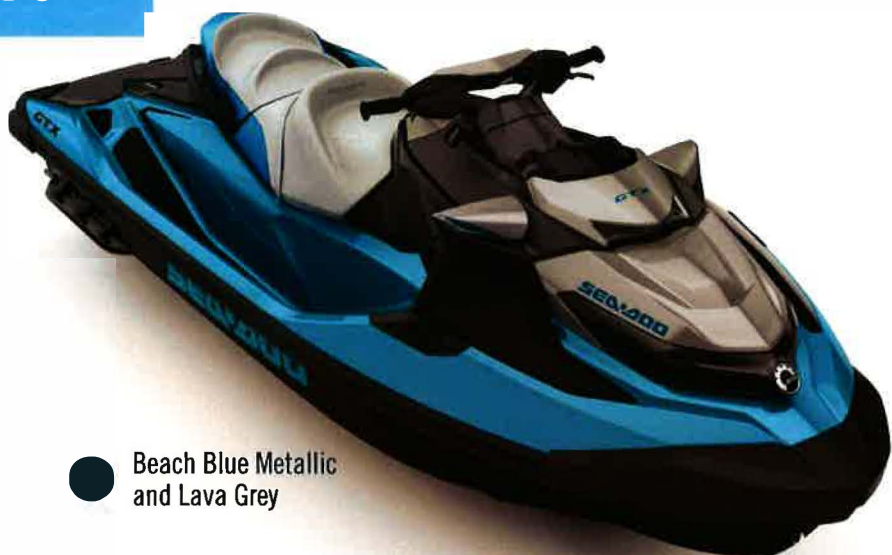
● Beach Blue Metallic and Lava Grey