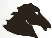
4 STROKE ENGINE - 49CC