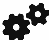
POLARIS VARIABLE TRANSMISSION